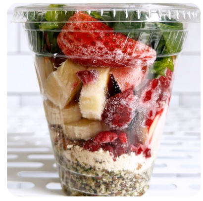
Strawberry Fields Forever