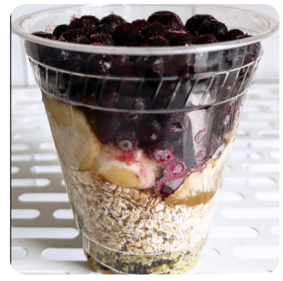
Blueberry Protein Oats